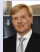
H.R.H. Prince Willem-Alexander