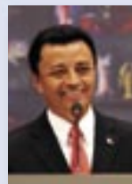
H.E. Marc Ravalomanana