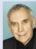
Prof. John Anthony Allan